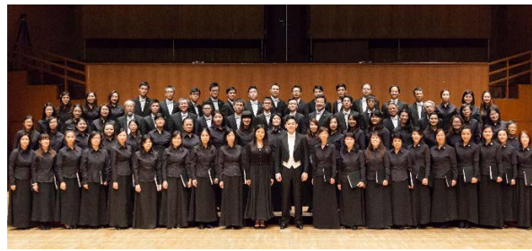
The Learners Chorus