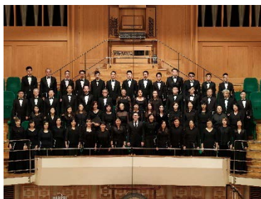
Hong Kong Philharmonic Chorus