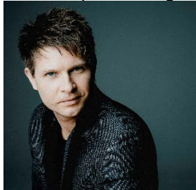
Krzysztof Urbański