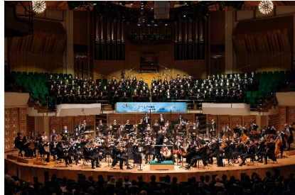
Hong Kong Philharmonic Orchestra